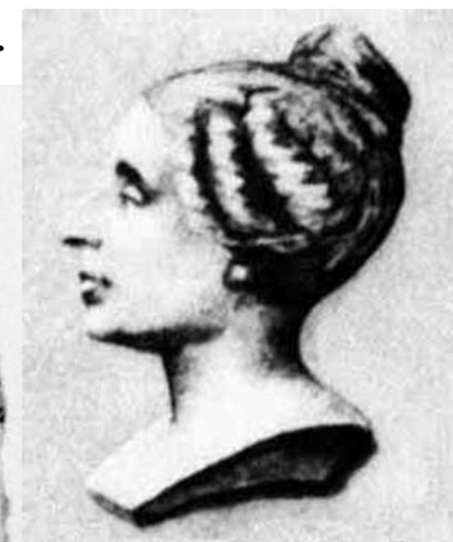
Sophie Germain (1778–1835)